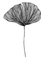
FLOWERS & PLANTS