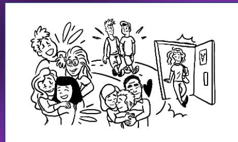
Screenshot from companion video

A video was produced to illustrate the reality of the lesbian, gay, bisexual, transgender, queer or questioning, or other (LGBTQ+) community and to show how any environment can become more inclusive. This video can be used by organizations/institutions as an educational and promotional tool.