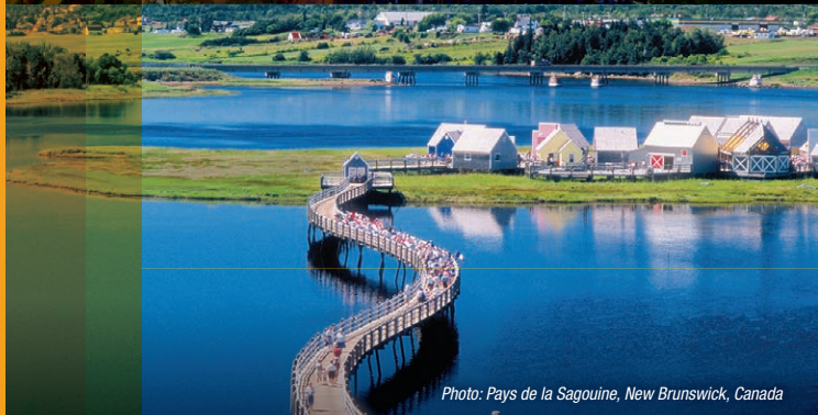
Photo: Pays de la Sagouine, New Brunswick, Canada