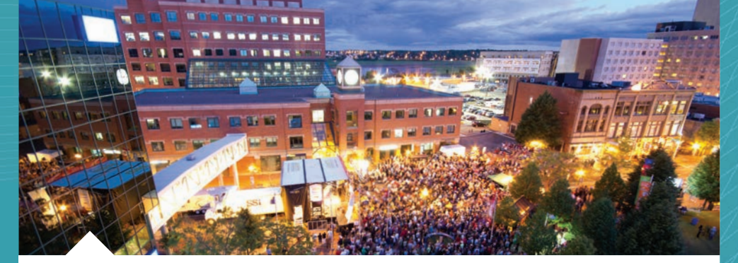
City of Moncton, New Brunswick, Canada