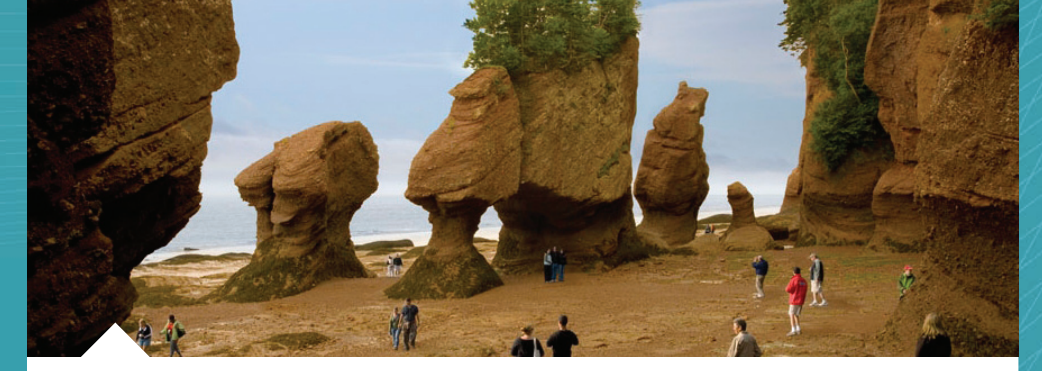
Department of Tourism and Parks, New Brunswick, Canada